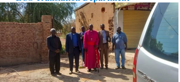
Main Diocesan Entrance Gate