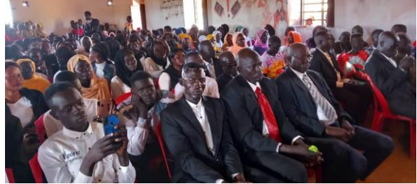
Reception of the Archbishop Team