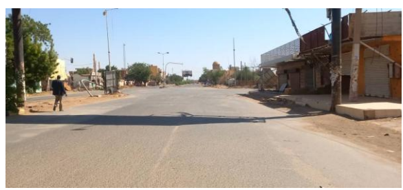
Cleaned Arbaien Street near the Diocese