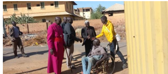
Disable man who remained in Church Savior!