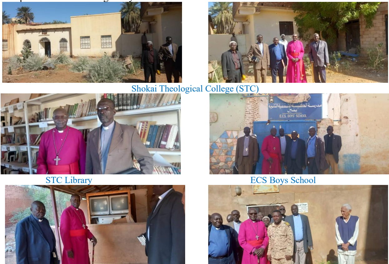
Abu Rof Clinic

On Saturday 28<sup>th</sup>, December, the team visited the Diocesan Offices, Church of Saviour, Shokai Theological College, CMS Mission Station (Irsaliya), Abu Rof Clinic and River House. You can see the damage and the devastation of all these properties. We prayed in the destroyed Church of Savior, Omdurman. Church of Savior is one of the old buildings to be destroyed. It was not possible to visit All Saints Cathedral, Khartoum because the part of Khartoum and Khartoum North Areas are still under the Rapid support Forces. The team received unconfirmed news that the Cathedral Compound has become a grave-yard!