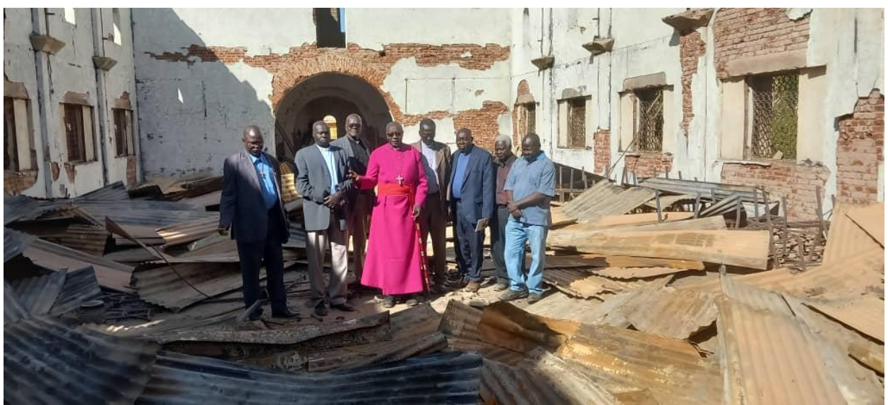
Bombed Church of Savior

Archbishop Ezekiel Kondo visits Khartoum for the first time since April 2023!