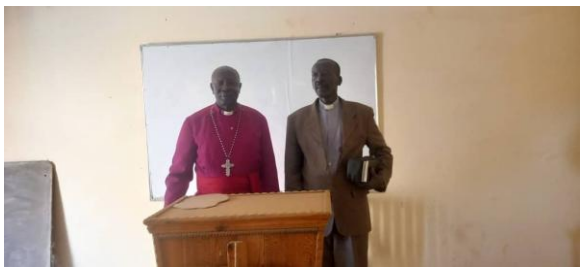
STC Lecture Room