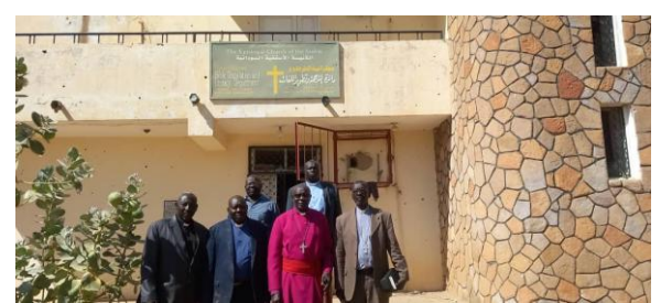
ECS Translation Department