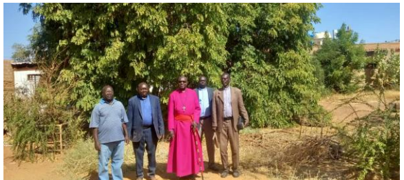
The Diocesan Tea drinking tree (Faiza)