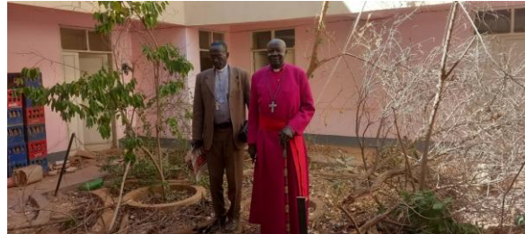
Inside ECSTD Building